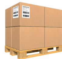
APL 60S 2 LABELS 3 pallets/min*

Due to our continuous improvement policy, our product specifications are subject to change without notice.